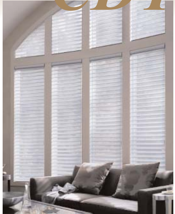
The exclusive Alustra Collection from Hunter Douglas elevates the windows in your home to a level of understated luxury, classic beauty, and distinctive design.

We hope you'll visit CDT for business and for pleasure this fall. We promise you a great experience either way!